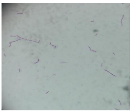
Fig. 2. Gram's staining of the isolate.