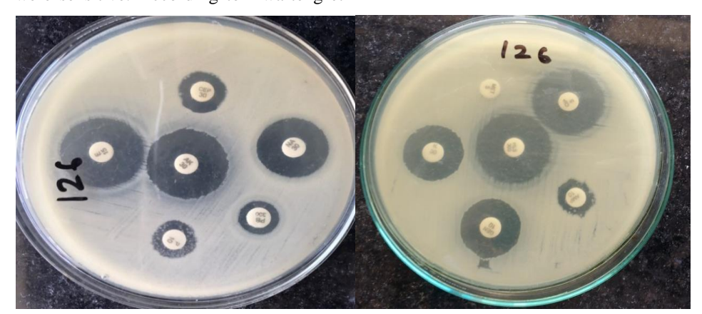
Fig. 3. Antibiogram of Bacillus cereus isolated from milk and milk products.