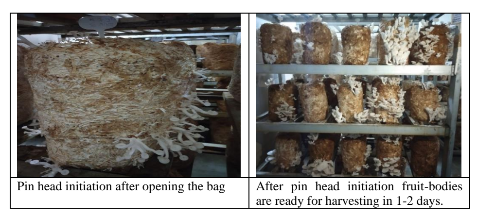
Plate 2. Steps in oyster mushroom cultivation.