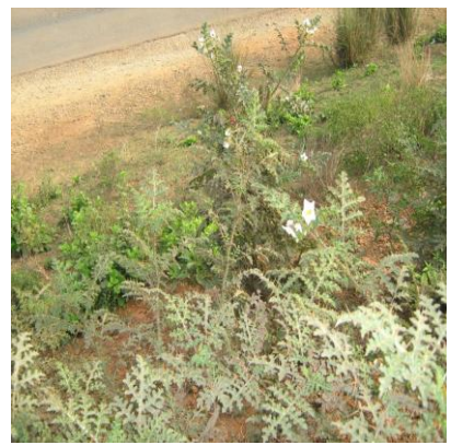
Fig. 1. View of natural occurrence of Solanum sisymbriifolium Lam. with flower.