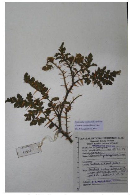
Fig. 3. Herbarium of Solanum sisymbriifolium Lam. deposited at CNH, Calcutta by (T.K. Paul).