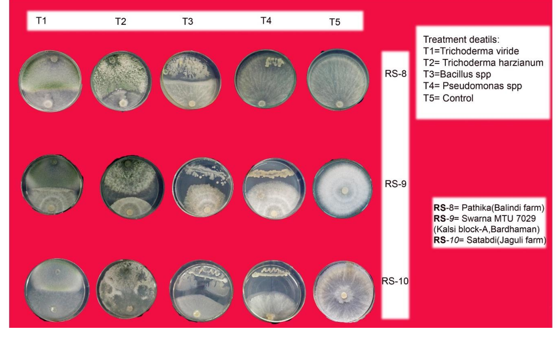
Plate 3. In vitro effect of antagonists against R. solani.

Table 10: In vitro evaluation of bio control against RS-10.