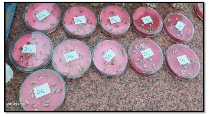
Fig. 2. Germination test after treatment of sodium azide.

Fig. 1. The seed are soaking in chemical mutagen sodium azide for 4 hours of various concentration.