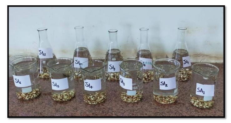
Fig. 1. The seed are soaking in chemical mutagen sodium azide for 4 hours of various concentration.