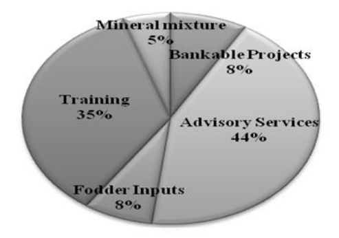
Fig. 2. Percentage of the respondents availed extension service.