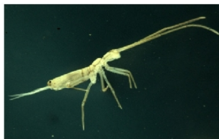
8. Yosia dehradunia Mitra, 1967