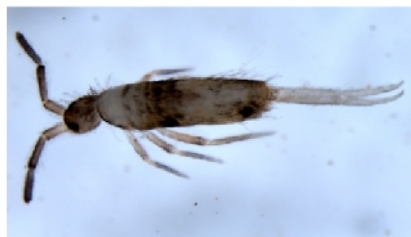
5. Seira indica (Ritter, 1911) Yosii, 1966