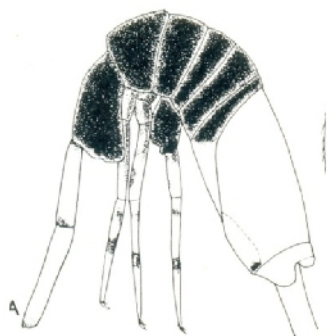
7. Callyntrura vestita (Handschin, 1925) Yosii, 1982