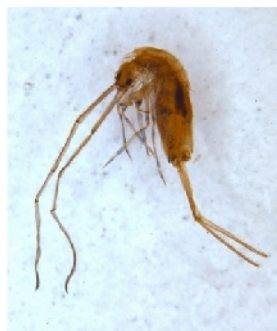
6. Callyntrura lineata (Parona, 1892) Yosii, 1961