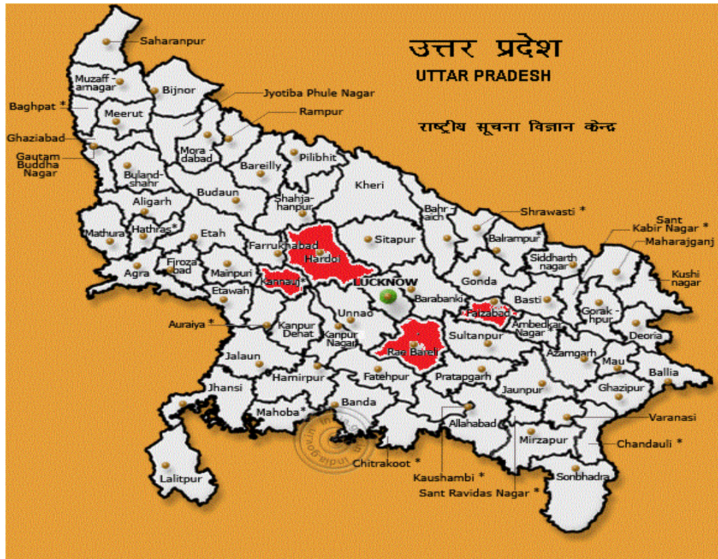
Fig. 1. Map of Study Area.

The method to estimate the bird diversity in this type of habitat is Belt transects. Transects of the size 1000m × 1000m, was laid in the cover of each wetlands. All birds species including ducks, cranes, waders and storks which are present in the transect were identified to the species level and their number was counted in all the 18 wetlands of four districts. Bird species present in were identified and systematic enumeration was made with the available relevant literatures and taxonomic revisions (Ali & Ripley, 1995; Grimmett et al. , 1998; Salim Ali, 2002).