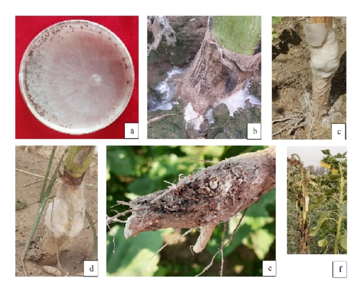
Fig. 1. a: Sclerotium rolfsii culture in Petri Plate, b, c: Mycelium infection on plant at collar region, d: Sclerotial formation on the stem, e: Sclerotial formation at the infected portion of the plant, f: Plant wilting after infection.

Disease Symptoms. Aycock (1966) explained the general symptoms produced by the fungus S. rolfsii which varies with different hosts. Generally, the infection develops on the collar region as lesion of dark brown-colored just below the soil lane (Fig. 1).