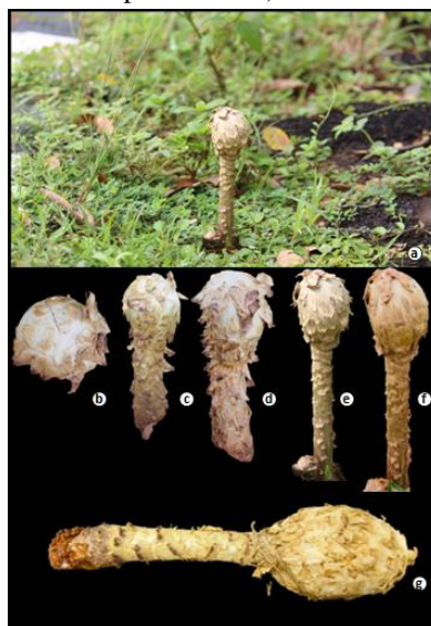
Fig. 1. a-Habitat, b-Bud, c to f—stages of development of Young basidiocarp, g—final stage.