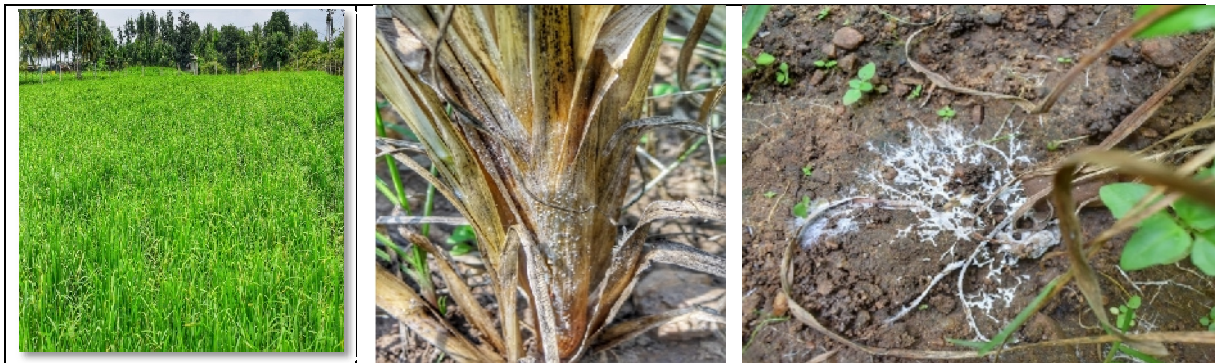
Plate1: Field view of survey for occurrence of foot rot disease in finger millet during Kharif-2019.

Incidence of foot rot on finger millet were reported by various workers from Coimbatore (Anon., 1954), Uttarakhand (Kumar and Prasad, 2010) and Gujarat (Waghunde et al. , 2011). The incidence of foot rot disease was observed in all the five districts surveyed. The maximum mean of foot rot disease incidence was observed in the Mandya district (42.14%) followed by Chamarajanagara (25.32%), Mysuru (20.71%) and Hassan districts (9.96 %). The minimum mean disease incidence was observed in the Tumakuru district (4.34%).