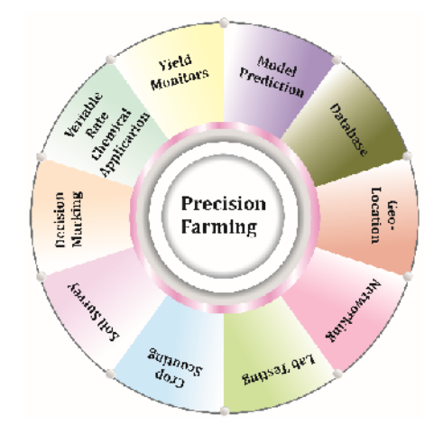
Fig. 4. A brief overview of precision farming approaches.

agriculture sector as well as, it could answer all the problems and emerge as a powerful tool for food sufficiency in developing countries (Roy, 2020). Precision farming is a kind of agriculture that entails the exact use of inputs in order to obtain greater average yields than are possible with conventional farming methods. This means that the system incorporates critical elements of information, technology, and management to optimise production in order to increase production efficiency while also improving product quality and crop chemical use efficiency while also conserving energy and protecting the environment (Shibusawa, 2002).