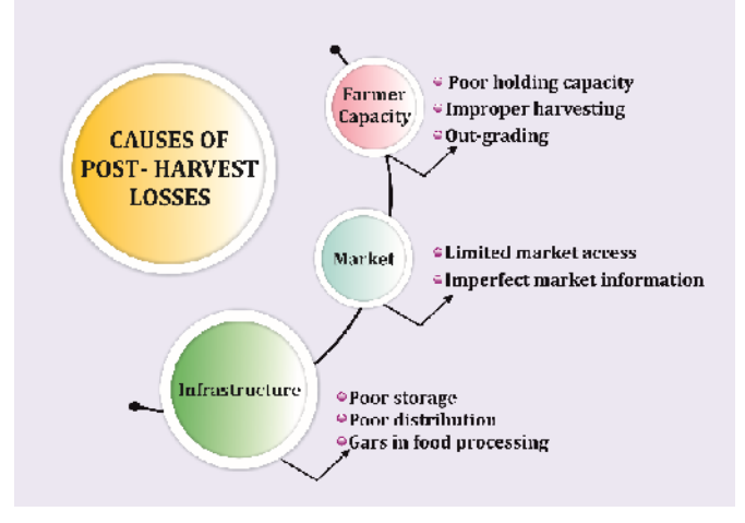
Fig. 2. Causes of post- harvest losses.

production was about one-and-a-half times the combined amount of fresh vegetables. Postharvest losses in fresh foods and commodities, such as dairy products and eggs, are estimated to be between 10 and 25 percent in most cases. It was estimated that between 30 and 40% of the projected losses in fruits and vegetables would occur (Hegazy, 2013). These figures are undesirable and have a negative effect on the Indian economy. Crop loss after harvest starts to accumulate rapidly in the production chain. Following post-harvest, there are four major stages in this production chain: harvesting and production; processing and product management; and market place connections. Efficiency is always an issue for crops. Efficiency is always an issue for crops. Incidence of post-harvest loss is considerable in the first two periods, with severe effects for small holders' farmers earnings (Ganesh et al., 2018). However, there has been minimal attention paid to value chain efficiency or examining the causes behind PHL trailing output. This exhibit illustrates many important post-harvest value chain inefficiencies that together lead to post harvest losses. There are several causes behind the Post-harvest losses, summarized details are mentioned in Fig. 2.