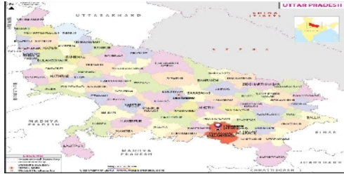
Fig. 1. Location of Prayagraj district in Uttar Pradesh state (India).

The experiment was carried out in the agro-climatic conditions of Prayagraj in department of horticulture, Naini Agricultural Institute. The region located on the right bank of the Yamuna, 6 kilometers south of Prayagraj city, on the Rewa road. It is located at 25°57' North latitude, 81°51' East longitude, and is 98 meters above sea level (MSL) this can be represented by Fig. 1.