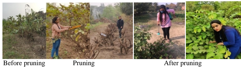
Table 1: Details of treatments combination.