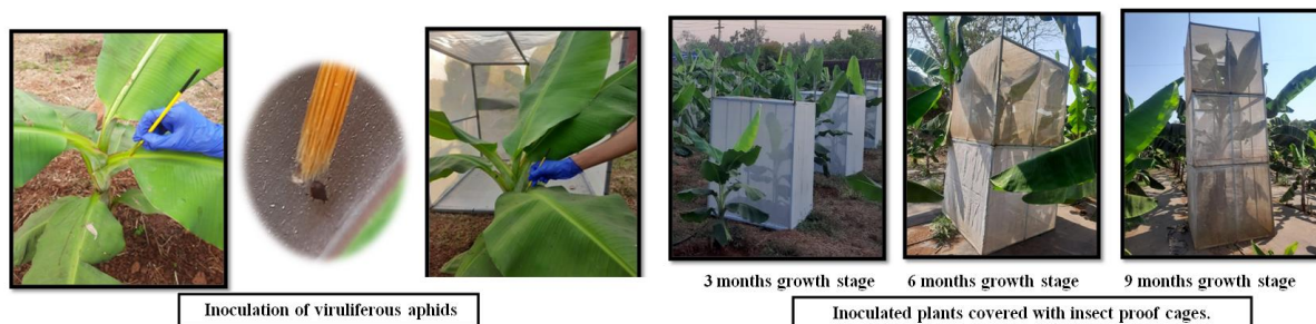
Fig. 1. Virus transmission by using insect vector.

SG- Stunted growth; LB- Leaf brittleness; MC- Marginal chlorosis; NSt- Necrotic streaks; BT - Bunchy top; NF- Non-flowering of the plant RLS- Reduction in leaf size