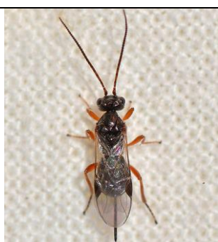
Fig. 3. Triaspis sp. recorded during experiment.