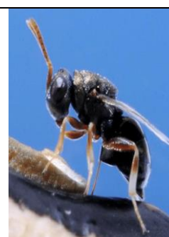
Fig. 4. Dinarmus basalis emerged from tested samples.

The results clearly indicate that all samples of bruchids were mostly parasitized by Dinarmus basalis (Fig. 4) and triaspis sp (Fig. 3.), during first year of July, August and second year of August September months. Minimum emergence of parasitoid was observed during month of January, February and June of both the years. Maximum emergence of parasites were observed with high humidity in both the years. Maximum build-up of parasitoids was observed during July to October months both the years because of high humidity. The findings are in confirmation with George (1990), who stated that greater frequency of Dinarmus basalis was observed from July to November indicating that high humidity is necessary for the development of parasitoid.