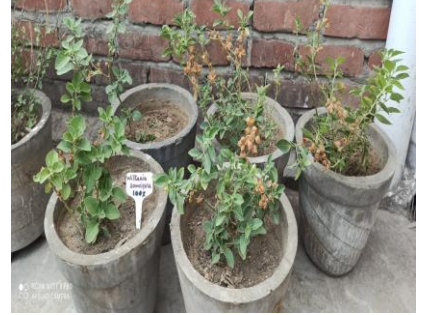
(a) Withania somnifera plant treated with 100% industrial effluent.