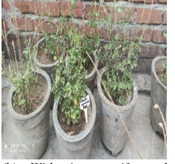
(b) Withania somnifera plant treated with 70% industrial effluent.