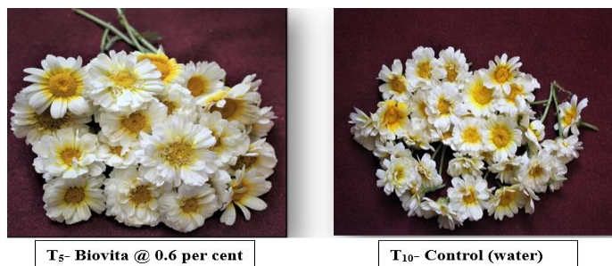
Plate 1. Annual chrysanthemum flowers of T 5 and Control.