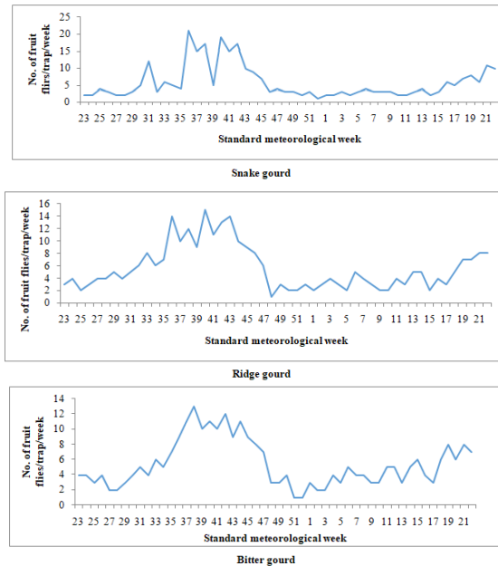
Fig. 2. Relative abundance of Z. cucurbitae using cue lure traps in gourds at Dharmapuri.