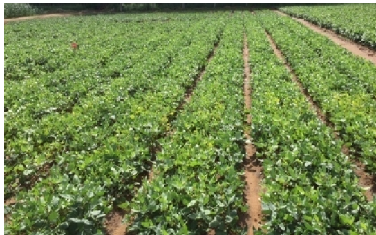
Fig. 2. Experimental Field View during vegetative growth of blackgram.

Treatment was imposed as per the standard method. In T 1 100 % Phosphorus was applied as basal and N and K were given through drip fertigation with urea and white KCl (0:0:60 NPK). In treatment T 2 and T 3 , fertigation was given through water soluble fertilizers viz. urea (46% N), mono ammonium phosphate (12:61:0 NPK), and sulphate of potash (0:0:50 NPK) in 8 splits at an interval of six days, out of which during the vegetative growth period (0-20 DAS) 60% N, 80% P and 20% K in three splits and 40% N, 10% P, and 40% K in three splits at 21-40 DAS (flowering stage). The remaining 10% P and 40% K in 2 splits at 41-55 DAS (Pod formation stage). Fertigation was stopped at 55 DAS. Weeds were controlled by spraying pendimethalin + imazethapyr (valor 32) @ 3liter /ha as pre-emergent on 3DAS followed by one hoeing on 25-30 DAS. The entire quantity of fertilizer (100% N, P, K) was applied as basal in treatment T 4 . Drip fertigation was given once in three days at the vegetative stages and once in 6 days at the reproductive stage (flowering and pod formation stage) as per the treatment schedule. Pulse