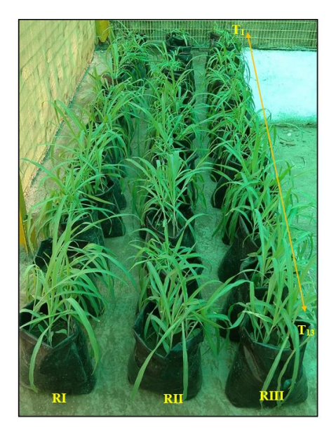
PLATE I. In vitro efficacy of soil organic amendments against R. solani f. sp. sasakii, causing BLSB of maize (Hy. Kanchan).

Pre-emergence seed rot (PRESR). The results (PLATE I, Table 1 & Fig. 1) revealed that the test organic amendments significantly influenced preemergence seed rot (PRESR) which ranged from 12.43 to 50.54 per cent, as against 67.70 per cent in untreated control. However, it was significantly least with Neem seed cake (12.43 %), followed by Castor seed cake