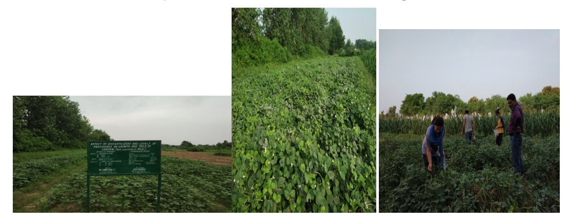
Fig. 2. Experimental Plot of cowpea.