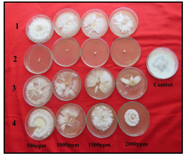
1- Wettable sulphur, 2- Chlorothalonil, 3- Mancozeb, 4-Captan

Fig. 2. Efficacy of different non-systemic fungicides on per cent inhibition of mycelial growth of A. caricae.