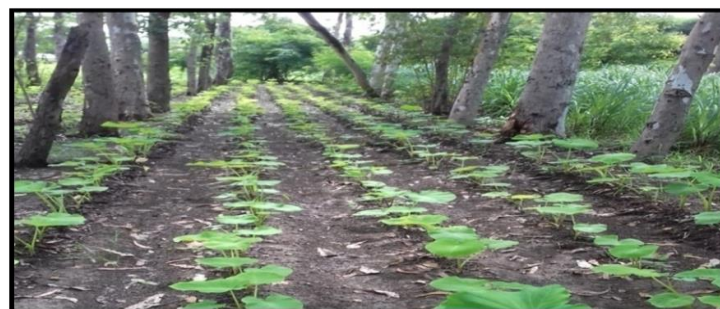
Fig. 4. A View of Experiment field (Colocasia crop under Eucalyptus-based Agroforestry system).