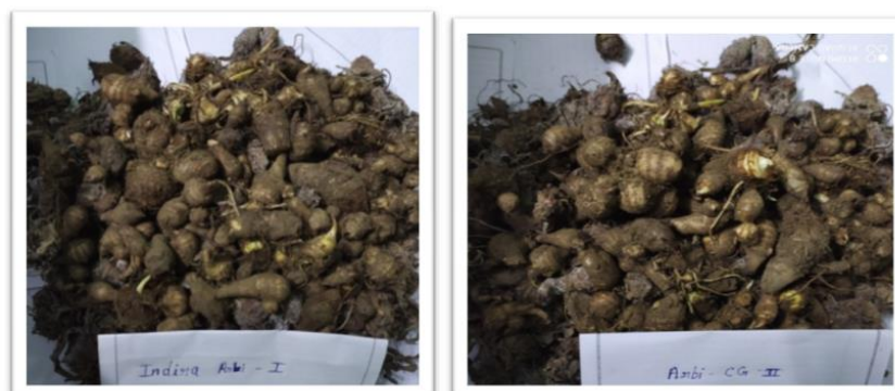
Fig. 3. Colocasia corm after harvesting of (a) Indira Arbi-1 (b) Arbi-CG-2.

Dry weight of Coloasia Corm. As per the data given in Table 2 reveals that the dry yield of colocasia tuber showed statistically non-significant where the maximum dry weight of colocasia tuber was recorded 29.92 q ha -1 in T 1 (RDF) and minimum yield 22.943q ha -1 in T 2 (zero fertilizer). In case of variety, Maximum dry weight of colocasia tubers was found 27.62 qha -1 in V-1 (Indira Arbi-I) & minimum 25.24 qha -1 in V-2 (Arbi-CG-II). In T \times V interaction maximum yield was observed in T-1 \times V-1 (32.22 q/ha) interaction and minimum in T-2 \times V-2 (22.87 q/ha) interaction. It might be due to fact, that it increased the vegetative growth period which leads longer growth duration and ensuring higher tuber yield and different genetic makeup of different varieties, Similar findings are reported by Muhammad et al. (2015); Akther et al. (2016). Suminarti et al. (2016) also reported that tuber yield per hectare was significantly influenced by fertilizer application. Similarly, Sen et al. (2007) also reported highest stolon yield in swamp taro with organic (25%) and inorganic (75%) source of nitrogen combination. An analysis on artificial shade on Taro ( Colocasia esculenta ) was performed by Gondium et al. (2018) and the results were the shading strength of 18%, over the entire cycle or in some of cycle tested, provides a high expansion of the development and growth of the crops.