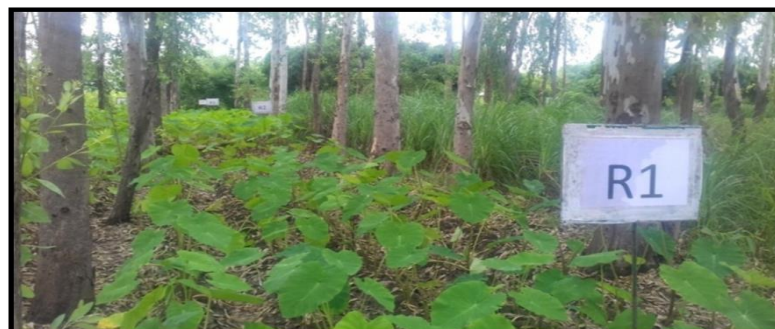
Fig. 5. Growth of Colocasia crop under Eucalyptus-based AFS during measurement.