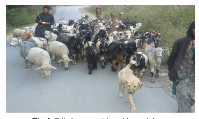
Fig. 2. Tribal communities with watchdogs.