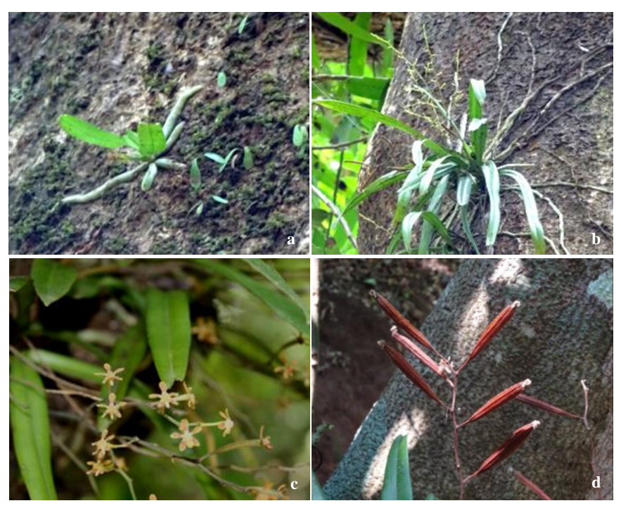
Fig. 1. Staurochilus ramosus (Lindl.) Seidenf (a) Juvenile plant; (b) Plant having flowering bud; (c) Flowers and (d) Seed bearing capsules.

14 species distributed in India, through SE Asia to the Philippines and Indonesia Pearce and Cribb (2002).