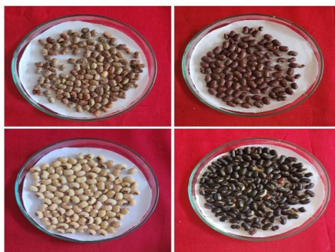
Fig. 1. Variation in seed colour of distinct cowpea genotypes.