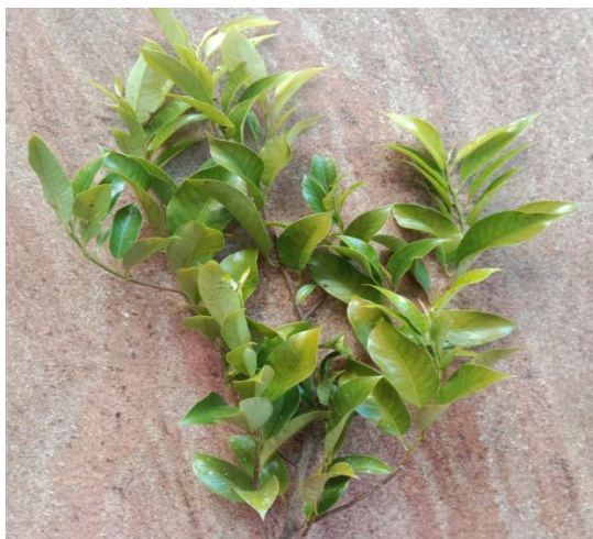
Fig. 1. Leaves of Myristica fragrans .