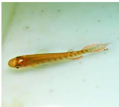
Fig. 4. Striped panchax ( Aplocheilichthys lineatus ).