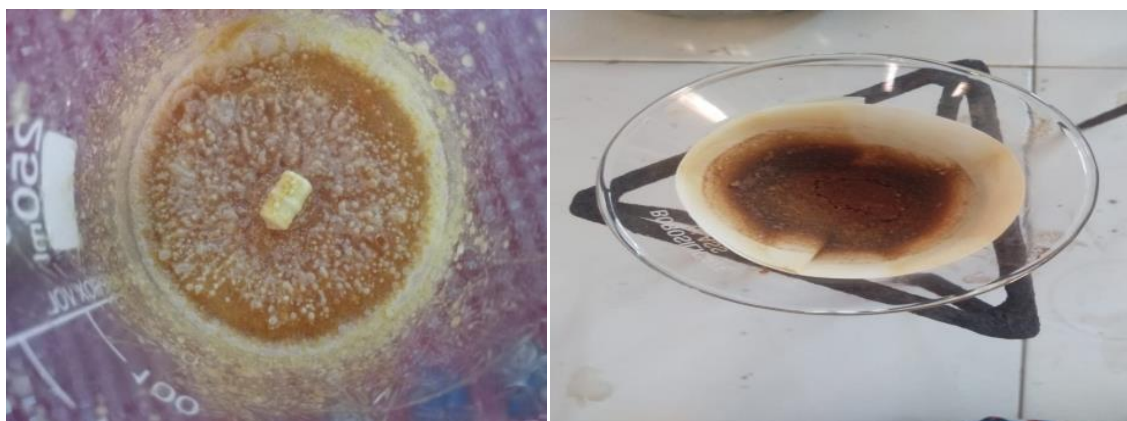
Fig. 2. Biosynthesis of ZnO nanoparticles from Myristica leaves.