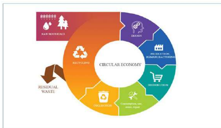
Fig. 1. Circular Economy Pillars (Adapted from European Parliament, 2023).