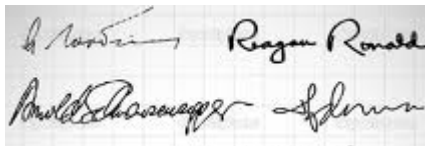
Fig.1. A sample of signatures.

Signatures can be treated as an image because a person may use any symbol, line, Curve & letter or group of letters as a signature Shown in fig1. Hence it is a perfect candidate for image processing & pattern recognition.