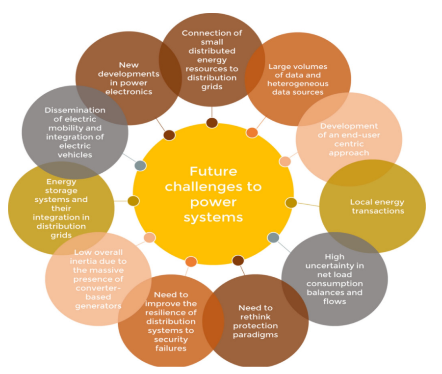
Fig. 3. Challenges in the ongoing transmission network.