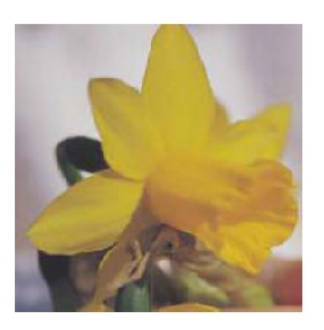
(3c) output image, c=2