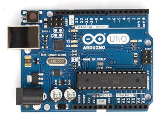
Fig. 3. Arduino board.

Physical Characteristics: The maximum length and width of the Uno PCB are 2.7 and 2.1 inches respectively, with the USB connector and power jack extending beyond the former dimension. Four screw holes allow the board to be attached to a surface or case. Note that the distance between digital pins 7 and 8 is 160 mil (0.16"), not an even multiple of the 100 mil spacing of the other pins.