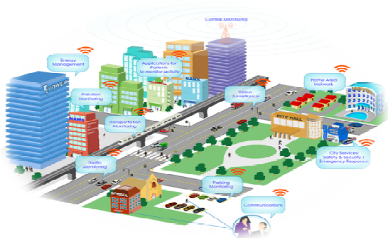
Fig. 1. Smart Cities Using IoT.

Smart cities are the best real time solutions for the troubles people usually face due to population outburst, pollution, less amount of energy supplies Smart surveillance, safer and automated transportation ,smarter energy management system.