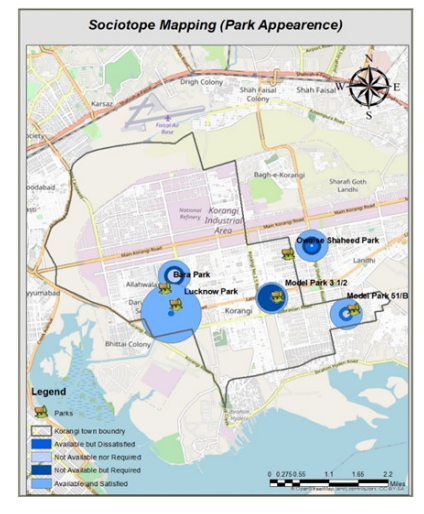
Fig. 5. Sociotope Maping of Health Facilities.