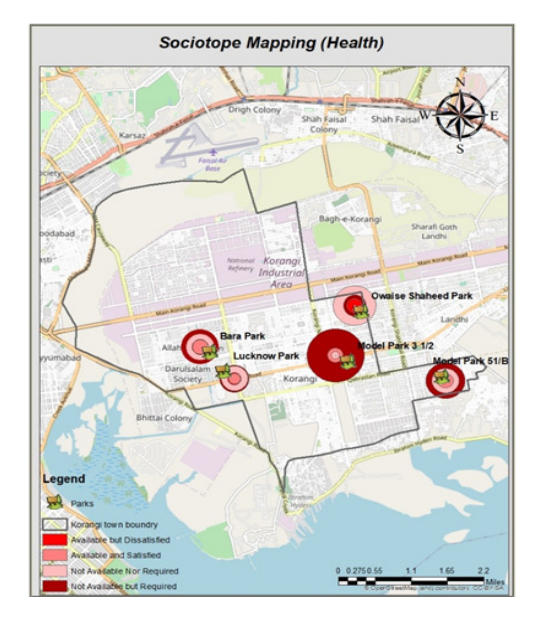
Fig. 4. Sociotope Maping of General Facilities.