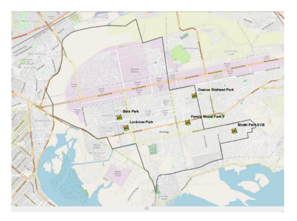
Fig. 2. Boundary of study area.