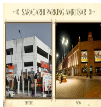
Fig. 3. Galliarda parking and Heritage street.