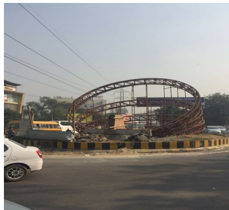
Fig. 7. Entry gate of Jalandhar city.

Entry gate of Jalandhar at B.S.F CHOWNK: While coming from the National highway 1, entry of Jalandhar is being face lifted by developing a beautiful structure on the centre verge or the roundabout.