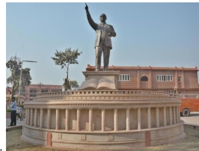
Fig. 2. Makeover of street leading to Golden.