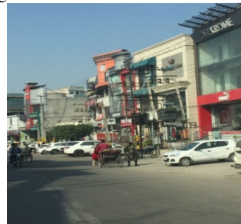
Fig. 11. Existing area of model town.

Landscaping of model town area: The motive is developing model town area from the existing chaotic area to a beautiful scenic area. For this the electricity line must be removed from the right of way (R.O.W) of the road and must be under ground. The reserved R.O.W must be lined interlocking tile and must be used for parking.