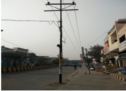
Fig. 13. Electricity in the middle of the road.

Shifting of Poles: The major hurdle in clearing the encroachments is the presence of electricity pole right in the middle of the road, the shopkeeper extend their belonging up to the electricity which may be present just in the middle of the lane, these electricity poles generally define the path on the road.