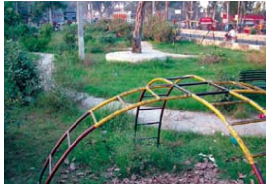
Fig. 5. Before beautification.

In this estimate, provision has been taken for installation of High-tech and Ultra Modern Musical Fountain, Decorative Electrical Lights, Three Entry Gates, Pedestrians and Pathway, Connecting Pathway, Pergolas, Rain Shelter, Public utilities, Children Fountains and Play Area, Landscaping, Gazebo, Signage and Deluxe Benches etc. The tentative cost of the project is Rs. 3.84 Crore.