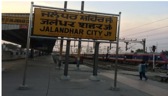
Fig. 4. Jalandhar railway station.

Jalandhar is famous for its sports industry, but also Hindustan Hydraulics who pioneered the manufacturing of high-tech CNC machines for sheet metal industry. The company has its customers not only in India but in countries like USA, Holland, Germany who are famous around the world for the manufacturing of machine tools.