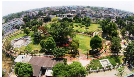
Fig. 6. After beautification project.

Entry gate of Jalandhar at B.S.F CHOWNK: While coming from the National highway 1, entry of Jalandhar is being face lifted by developing a beautiful structure on the centre verge or the roundabout.