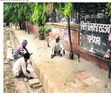
Fig. 12. Workers busy in giving facelift to street.

Brick paving of the dirt path: The road side and parking area must be fitted with interlocking tiles. These tile generally give a fresh look to the street and easy to maintained