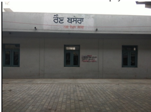
Fig. 9. Night shelter underneath the bridge.

Damoria rail over bridge: The bridge built the railway station Jalandhar; it has ample space underneath it but was not utilized until the beautification project started.