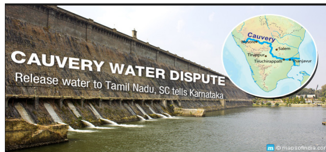
Fig. 1. Cauvery Water Dispute.

Today majority of the urban water bodies in urban areas are in a very bad state. The water bodies located in cities and rivers running through the city are degraded in nature in which they are unfit for consumption as we have seen the evident how important it is for planner to consider the water bodies as they consists only around 21% of the total fresh water available globally (Peter H. Gleick 1993). In the future, it is said that water will be a major crisis. Fights, violence and even wars may arise due to this resource. We have seen the recent Cauvery water dispute between the two Indian states of Karnataka and Tamil Nadu, how violence have erupted between the two. More instances may arise if the water bodies are not managed properly. Overexploitation of water resource in urban areas, pollution, floods and other natural disasters are other threats which urban water bodies are facing apart being acute shortage of this scarce resource.