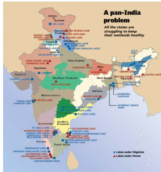
Fig. 2. Overview of India's water bodies