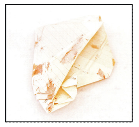
Fig. 6. Disputed document encountered at crime scene.