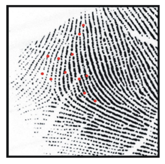
Fig. 8. Use of AFIS in the suspect identification.