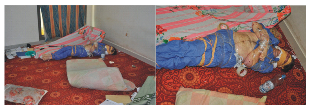
Fig. 2. Position of the body and other evidences encountered.

Fig. 3. The dead body lying on the floor, tied with different adhesive tapes with strange red marks on nose along with the water bottle kept beside.