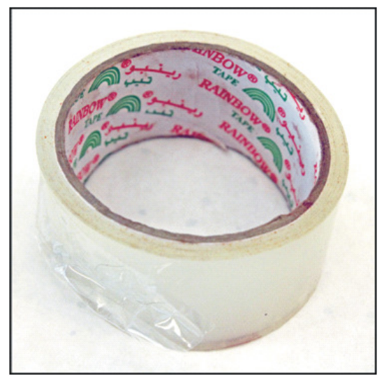
Fig. 4. The adhesive tape encountered on the crime scene.