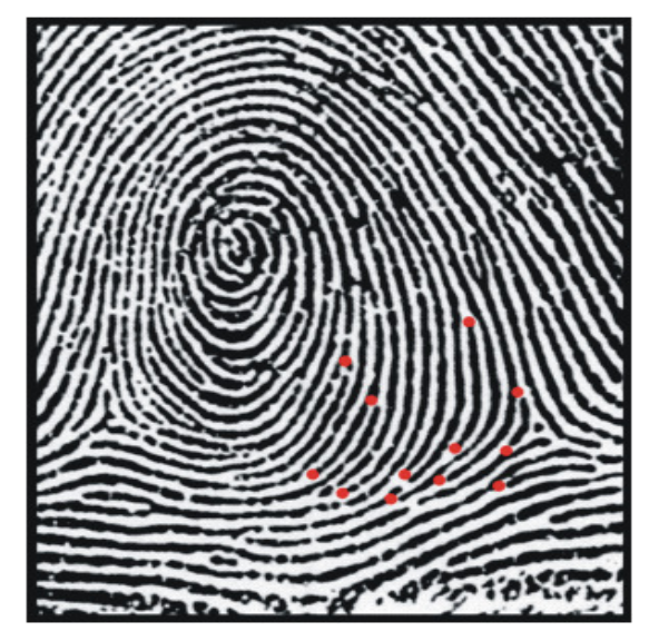
Fig. 9. Use of AFIS in the suspect identification.