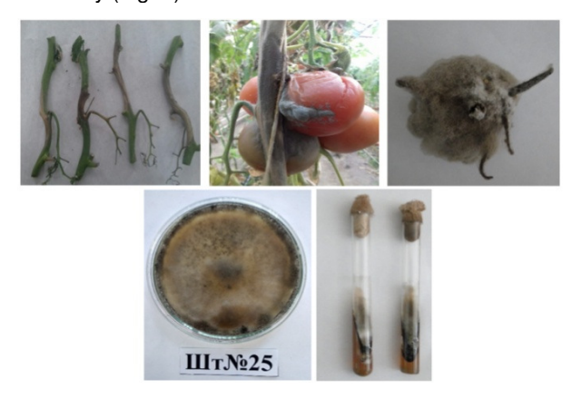
Fig. 1. Disease patterns (above) and their growth in Czapek agar nutrient media (below left) and wort agar nutrient media (below right).

Graymold disease pathogen B. cinerea infects all aboveground parts of tomato plant. In order to isolate B. cinerea isolates, the tomato plants were grown in the greenhouse of "Innovative work and extension center" state unitary enterprise at Tashkent state agrarian university (Fig. 1).