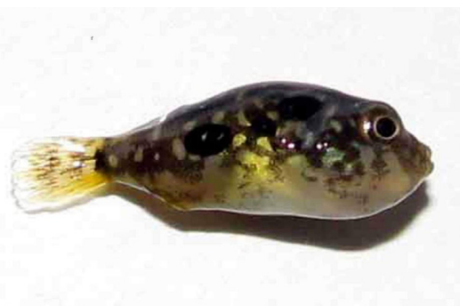
Fig. 1 C. travancoricus (Total length 30mm)