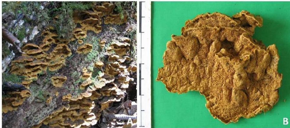
Fig. 1. Cyclomyces fuscus ; A – Growing on substratum; B – Close up photo (pore surface).