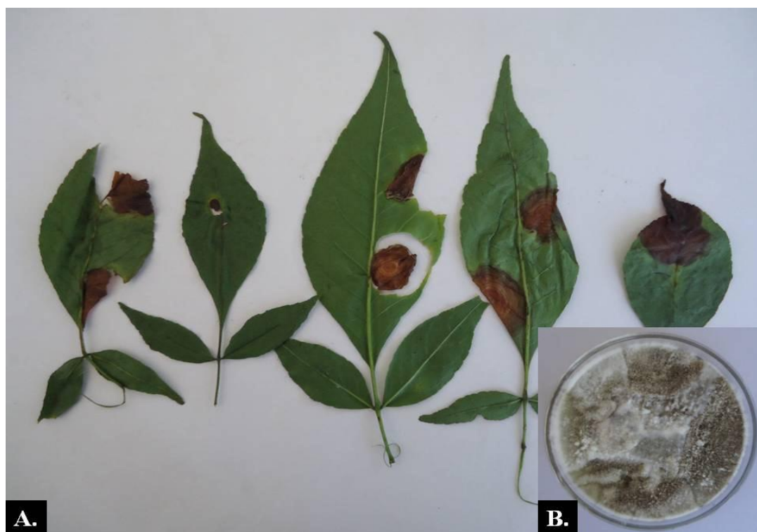
Fig. 1. A. Disease symptoms on A. marmelos leaves. B. Culture of S. aeglicola on PDA