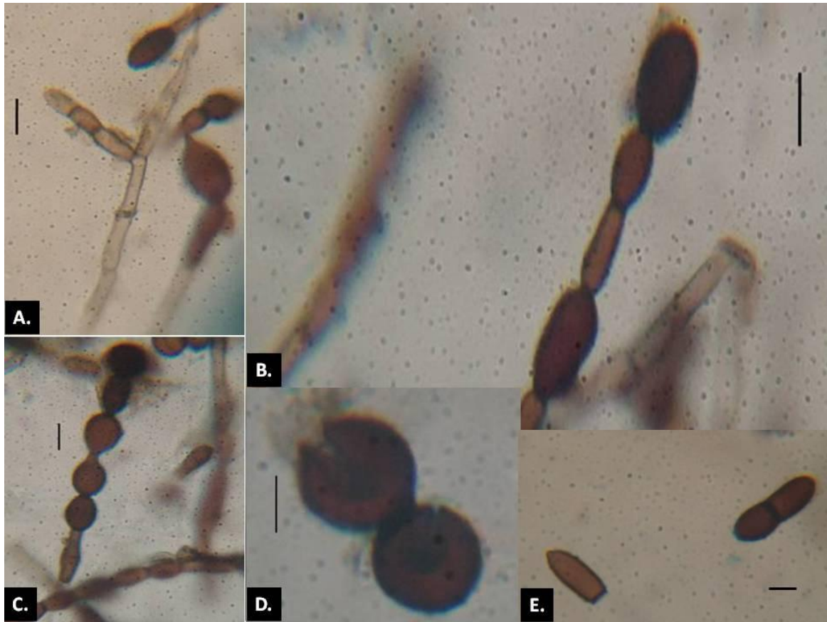
Fig. 2. Microscopic characteristics of Fungus. A. Mycelium. B – D. Chlamydospores. E. arthroconidia. Scale Bar = 10 µm