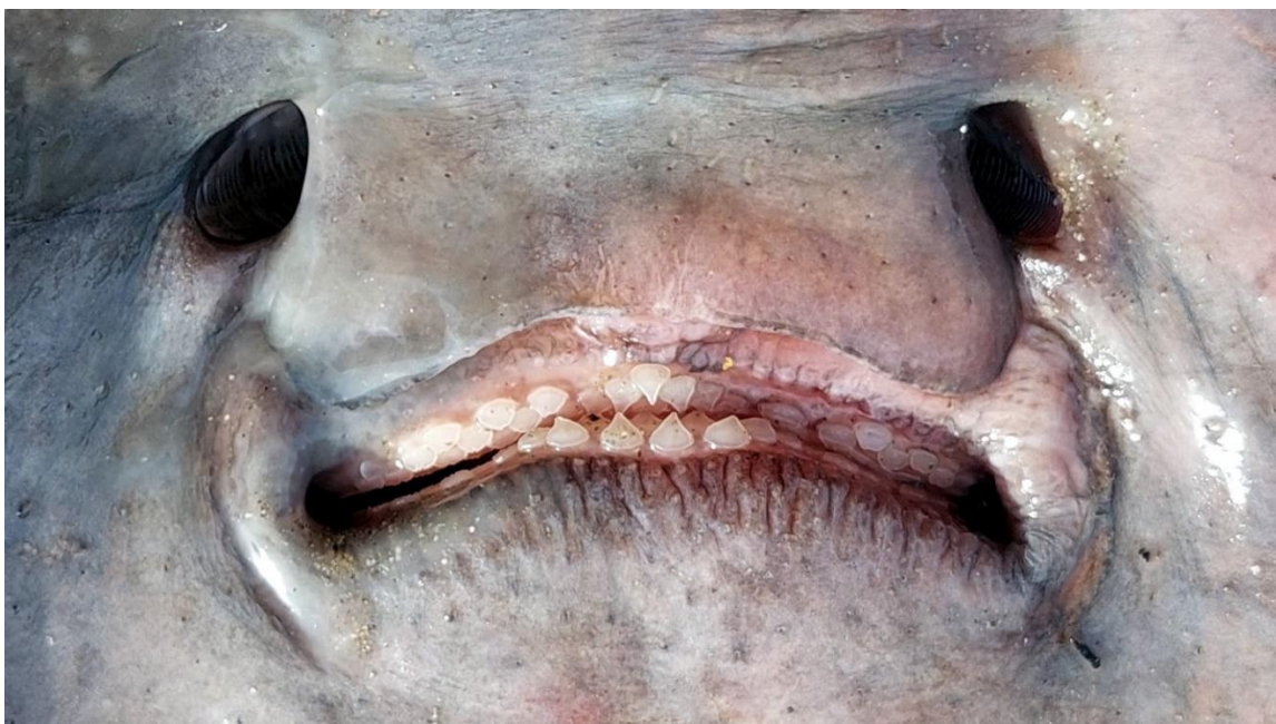
Fig 3. Mouth, dental apparatus and nostrils of Pteroplatytrygon violacea (Bonaparte, 1832) from Albanian seas.

Although currently considered as Least Concern (IUCN 2016) the pelagic stingray is facing many threats in the Mediterranean Sea and throughout the world (Domingo et al. 2005). It is mostly landed by pelagic longlines and trawls and is usually discarded as bycatch (Baum et al. 2009). While there are no local assessments given for the Adriatic and Ionian seas, it is extremely important to expand the scientific knowledge on the distribution, frequency, biology and threats to avoid plausible declines in the future.