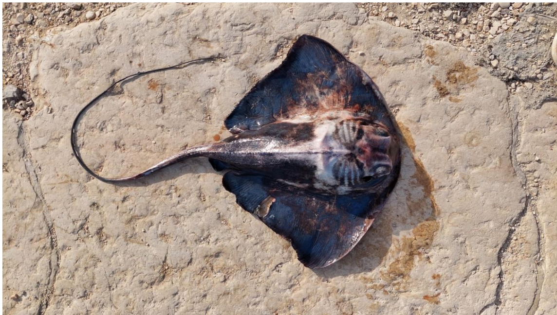
Fig 2. A specimen of Pteroplatytrygon violacea (Bonaparte, 1832) collected at the Gjiri i Vlorës, the meetingpoint of the Adriatic and Ionian Sea.