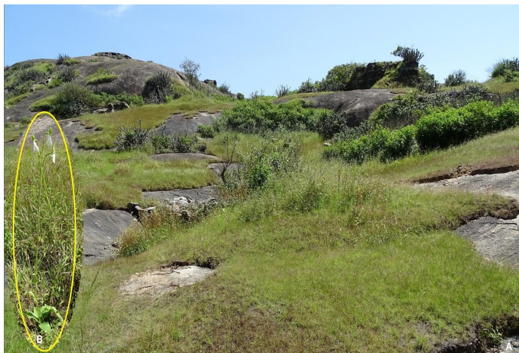
Fig. 2 A. Habitat and B. Habit of H. longicorniculata at Mount Abu wildlife sanctuary, Rajasthan.