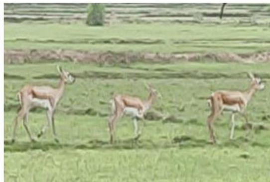
Fig. 3 Female