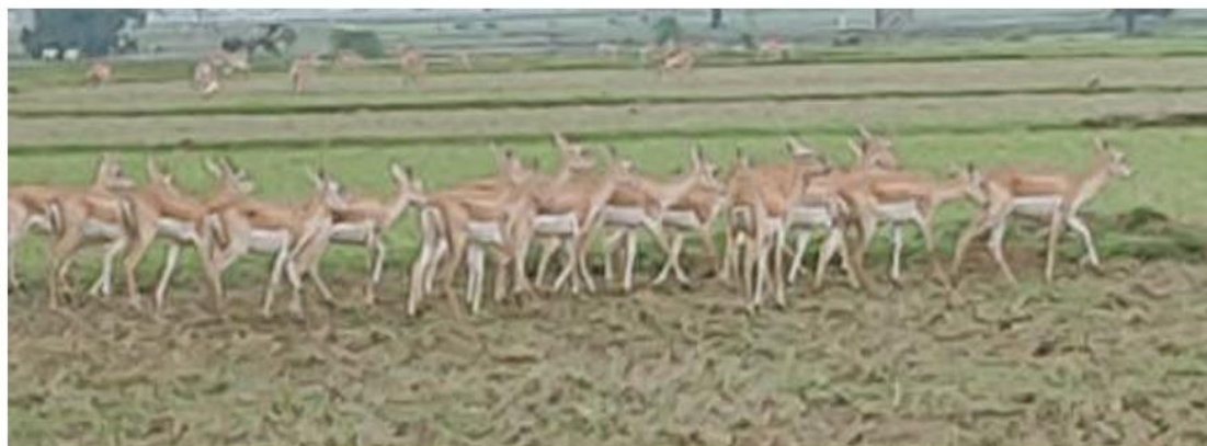
Fig. 4. Blackbucks heard standing near the paddy field Dumraon