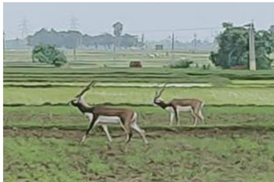
Fig. 2. Male

many times Nilgai and Blackbucks near the Bhagar oxbow lake areas in Simri, Chakki, Gaighat and Brahampur, Dumraon during the survey period of research project during the summer season; these areas was found harbor of wild animals' species like nilgai , blackbuck, wild boars etc.