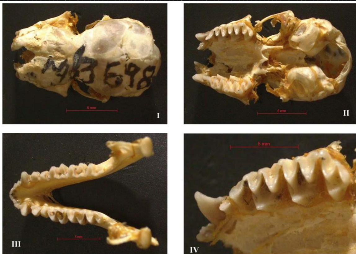
Fig 3: Pipistrellus ceylonicus I) Skull: dorsal view, II) Skull: ventral view, III) Lower jaw, IV) Upper tooth row

According to Lal (1984), taxonomic studies have been made on subspecies of P. ceylonicus found in India. All specimens from India should be referred to as P. c. indicus with the taxa chrysothrix and subcanus included as synonyms. There is a considerable individual variation in pelage colour with reddish brown and grey individuals found in the same colony (Brosset 1962c). Phillips (1980) suggests that older individuals assume a more reddish golden hue. Kellart in 1852 illustrated the species Scotophilus ceylonicus from Trincomalee, Ceylon. Dobson in 1878 described Vesperugo indicus from Manglore, Malabar Coast, India. Wroughton in 1899 described Pipistrellus chrysothrix from Mheskatri, Surat Dangs, India and Thomas in 1915b depicts P. c. subcanus species from Yalala, Junagarh and Kathiawar India. After comparative studies on colorations as well as external and skull measurements among Indian subspecies of P. ceylonicus disclose that no specific differences in previously recognized Indian subspecies and considered as P. ceylonicus indicus is only a valid subspecies occurring in India while rest were only the synonyms of it (Lal 1984). The measurements (Table 1) of the specimen (present study) and other morphological, cranial and dental structures matches with the study by Bates and Harrison (1997) is in large extent and identified as Pipistrellus ceylonicus (Kelaart 1852).